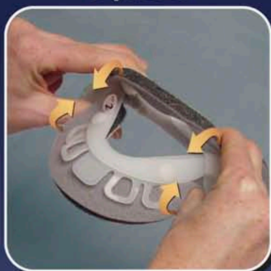
After centering the back panel, squeeze the front panel for easy application.