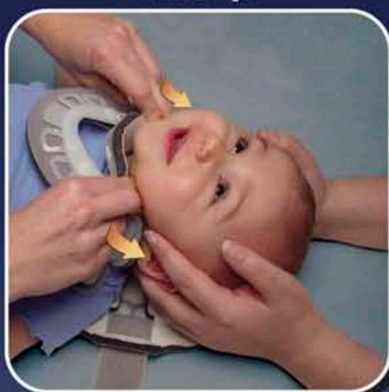
Scoop the front panel up and under the chin.